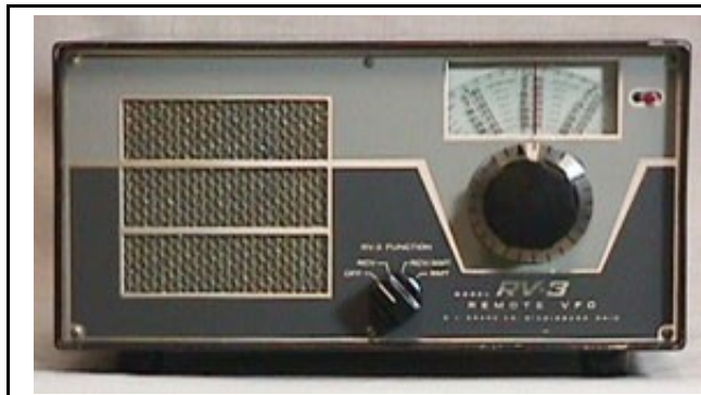
Drake RV-3 External VFO

Drake did offer an alternative to RIT by offering a full external VFO, the model RV-3, for use with the TR-3 Transceiver. With the RV-3 one could separate receiver and transmitter frequency – perhaps leaving the transmit frequency static while adjusting the receiver.