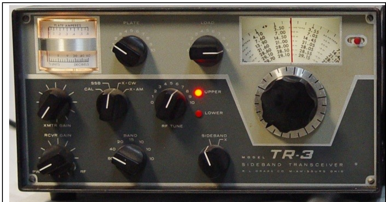
Drake TR-3 80-10 Meter SSB/AM/CW Transceiver in 1963

This Drake TR-3 article is the first of a two-part series on the Drake Vacuum Tube Transceivers. This article shows the TR-3 while the next one shows the TR-4 and TR-6.