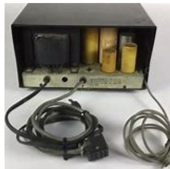
Drake RV-3 showing the AC-3 Power Supply mounted in the rear