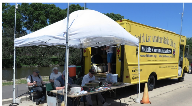
Above and below, the crew mans our exhibit.

This man, who visited our truck, is a serviceman who served in Afghanistan. He personally thanked us for what we do to service our community. On numerous occasions Ham Radio operators connected with his family and the families of other service members. An incredible moment for the guys at Walleye Weekend.